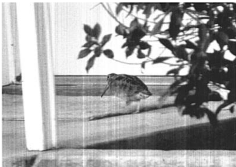
Figure 3. American Woodcock at Iron Mountain Pumping Plant, San Bernardino County, California, 9 November 1998. Note the bold gray "V" on the mantle and the gray stripes through the scapulars.