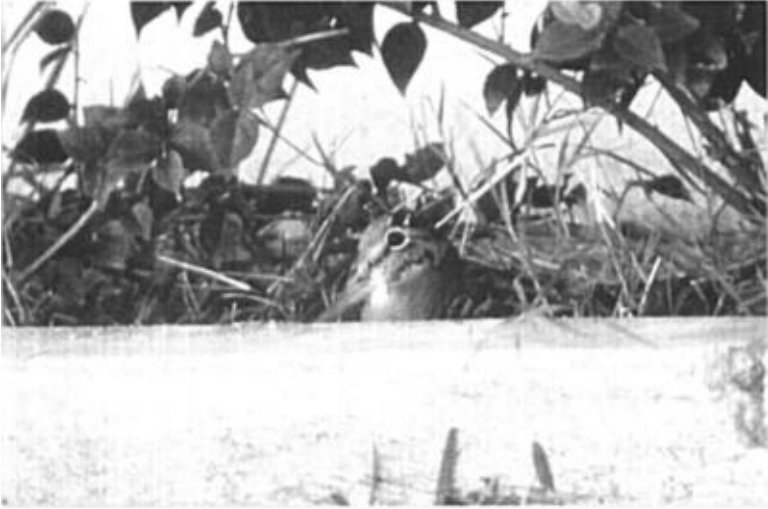
Figure 1. American Woodcock at Iron Mountain Pumping Plant, San Bernardino County, California, 9 November 1998. The black barring on the rear crown is diagnostic of Scolopax .