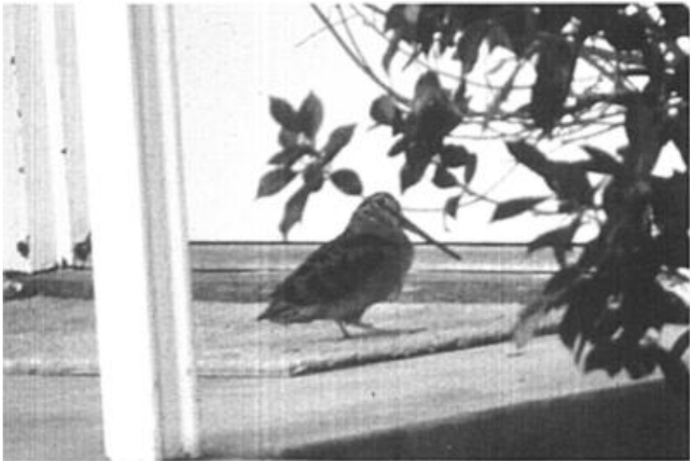
Figure 2. American Woodcock at Iron Mountain Pumping Plant, San Bernardino County, California, 9 November 1998. Note the unbarred cinnamon underparts.