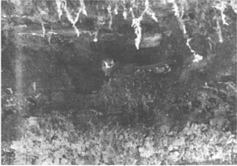
Figure 2. A Black Swift nestling at Fern Falls. Shoshone Co., Idaho.