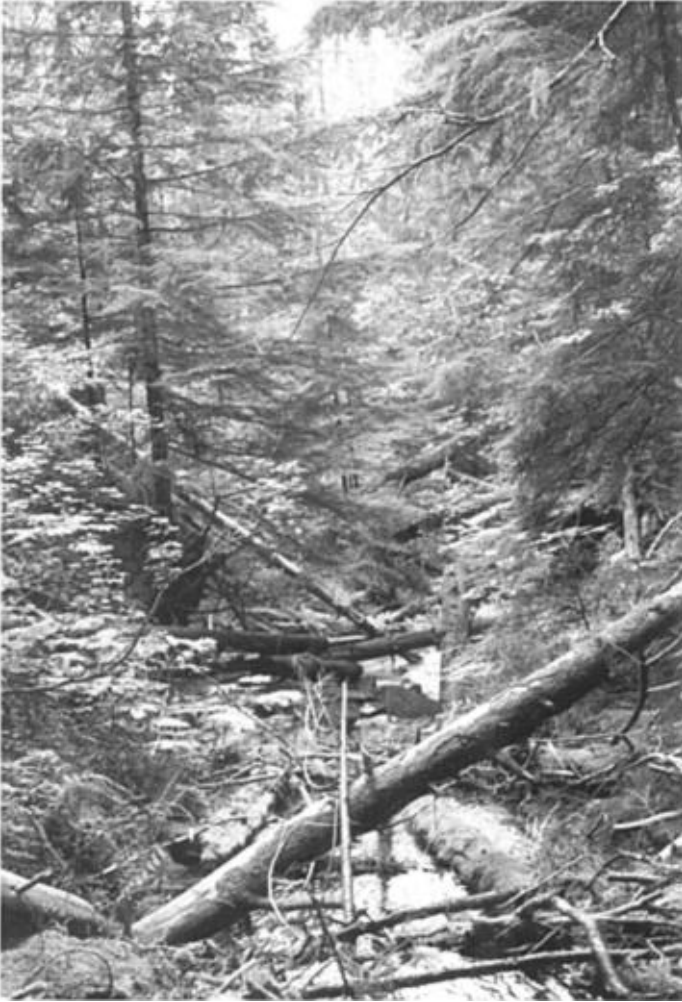
Figure 3. View directly downstream from Shadow Falls. An adult Black Swift was observed flying through this forest when leaving the nest,