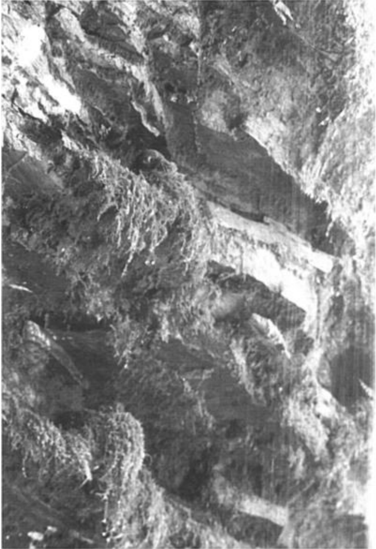
Figure 1. Three Black Swift nestlings behind Shadow Falls, Shoshone Co., Idaho.