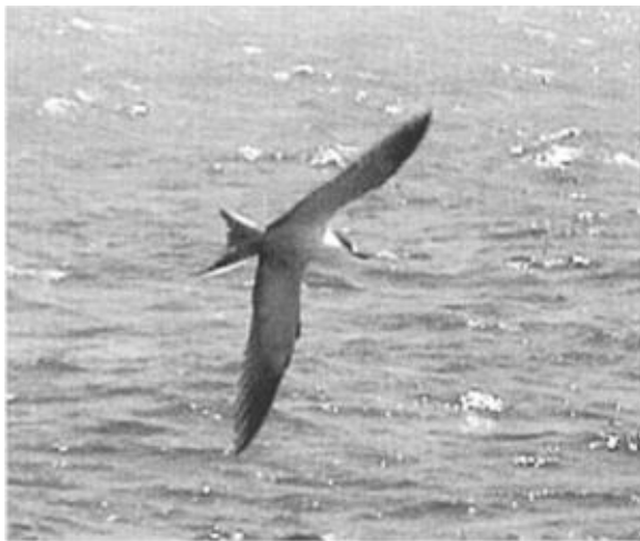
Figure 6. This adult or near adult Sooty Tern, Sterna fuscata , flew past an organized pelagic trip 10.8 miles west-southwest of Tomales Point, Marin Co., 26 August 2001, for northern California's first record.