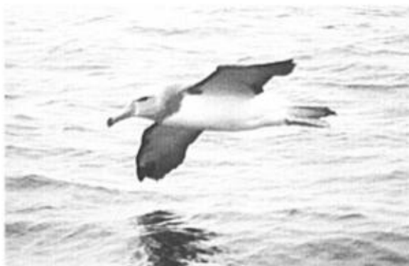
Figure 1. Shy Albatross, Thalassarche cauta , 27 July 2001, over Bodega Canyon, off Marin County. Some features suggest that this bird is of the subspecies salvini , but that determination remains unresolved.