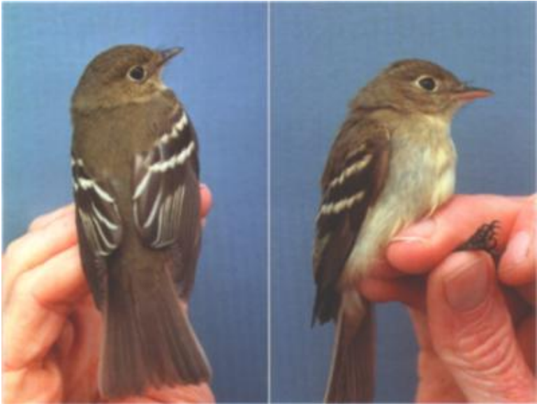
Figure 7. This Yellow-bellied Flycatcher, Empidonax flaviventris , was captured and banded on Southeast Farallon Island, 4 October 2001. Note the relatively uniform thin buffy eye ring typical of this species.