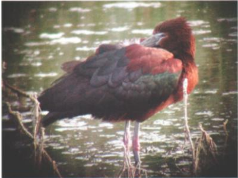
Figure 3. Adult Glossy Ibis, Plegadis falcinellus , at Alviso, Santa Clara Co., May 2001; this bird, the first for northern California, and representing California's second accepted record, was also reported just to the north in Alameda County on 20 and 21 May 2001.