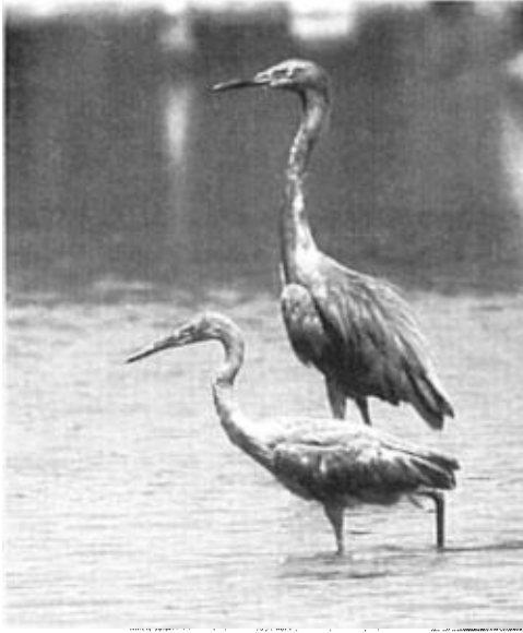
Figure 2. Immature (left) and adult Reddish Egrets, Egretta rufescens , 17 August 2001 at Obsidian Butte, south end of Salton Sea, Imperial Co. Exceptional numbers of this species were recorded on the southern coast and in the interior of California in 2001.