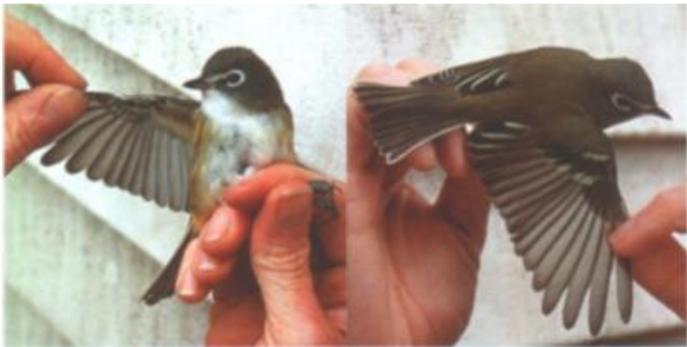
Figure 8. This Blue-headed Vireo, Vireo solitarius , was captured and banded on Southeast Farallon Island 21 September 2001. The most notable features seen in these photographs include the blue-gray head contrasting with the greenish back, the bold white "spectacles," and the bold white throat contrasting sharply with the sides of the face.