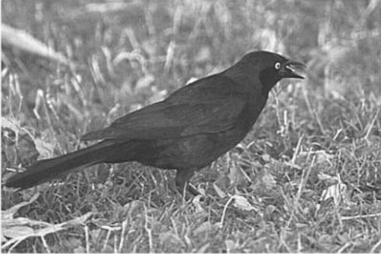
Figure 15. This Common Grackle, Quiscalus quiscula , was photographed in the Sepulveda Basin, Los Angeles Co., 9 June 2001.