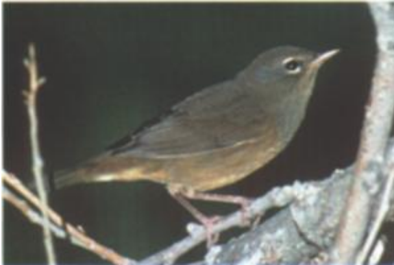
Figure 12. The relative thickness of the eye crescents on this Mourning Warbler, Oporornis philadelphia , photographed in California City, Kern Co., 25 September 1999, proved to be somewhat problematic for the committee. The calls of this bird, heard on the audio portion of a videotape, helped establish its identification.