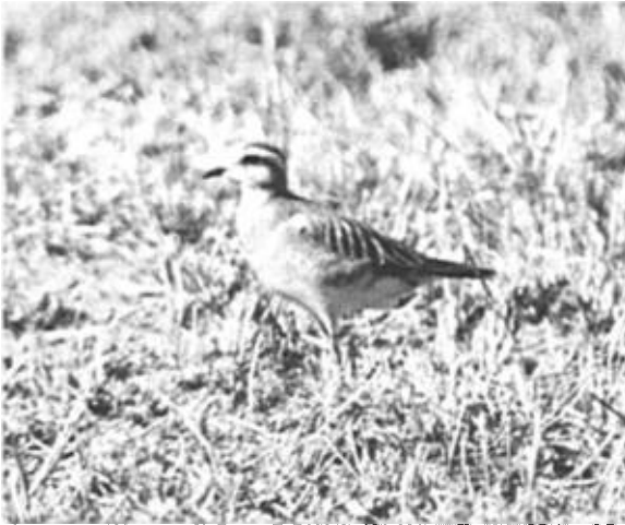
Figure 5. California's first winter Eurasian Dotterel, Charadrius morinellus , was photographed near Calipatria, Imperial Co., 21 January 2001.