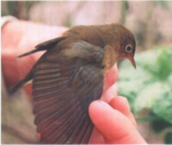
Figure 11. This Connecticut Warbler, Oporornis agilis , was captured and banded on Southeast Farallon Island, 23 September 2001.