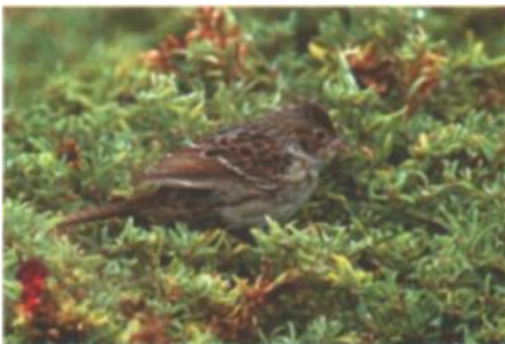
Figure 14. This Cassin's Sparrow, Aimophila cassinii , photographed on San Clemente Island, Los Angeles Co., 2 November 2001, was only the ninth recorded in California in fall.