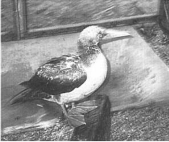
Figure 16. This Nazca Booby, Sula granti , came aboard a fishing boat in Mexican waters about 60 miles southwest of San Diego, San Diego Co., riding the boat into San Diego Bay. This photograph was taken in captivity at Project Wildlife, San Diego, 2 June 2001.