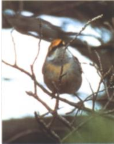
Figure 10. Golden-winged x Blue-winged Warbler, Vermivora chrysoptera x V. pinus , at Point Loma, San Diego Co., 19 May 2001. Note the fairly extensive yellow on the breast and belly of this female, indicating a hybrid.