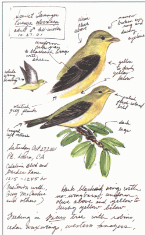
Figure 13. Scarlet Tanager, Piranga olivacea , 27–28 October 2001, Point Loma, San Diego Co. This sketch represents one of 12 Scarlet Tanagers recorded in California in 2001.