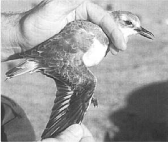
Figure 4. The exhaustive documentation of North America's first Greater Sand Plover, Charadrius leschenaultii , included in-hand measurements and plumage analysis after the bird was trapped at Stinson Beach, Marin Co., on 15 March 2001.