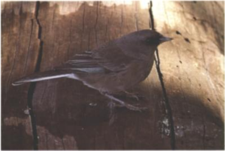
Figure 1. Guadalupe Junco, Junco (hyemalis) insularis , northern cypress grove, Isla Guadalupe, 10 March 2003.