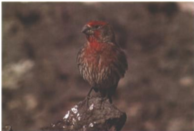
Figure 3. Guadalupe House Finch, Carpodacus mexicanus amplus , Campo Sur, Isla Guadalupe, 23 January 2003.