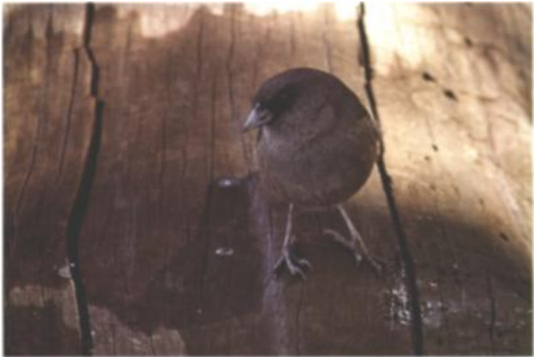
Figure 2. Guadalupe Junco, Junco (hyemalis) insularis , northern cypress grove, Isla Guadalupe, 10 March 2003.