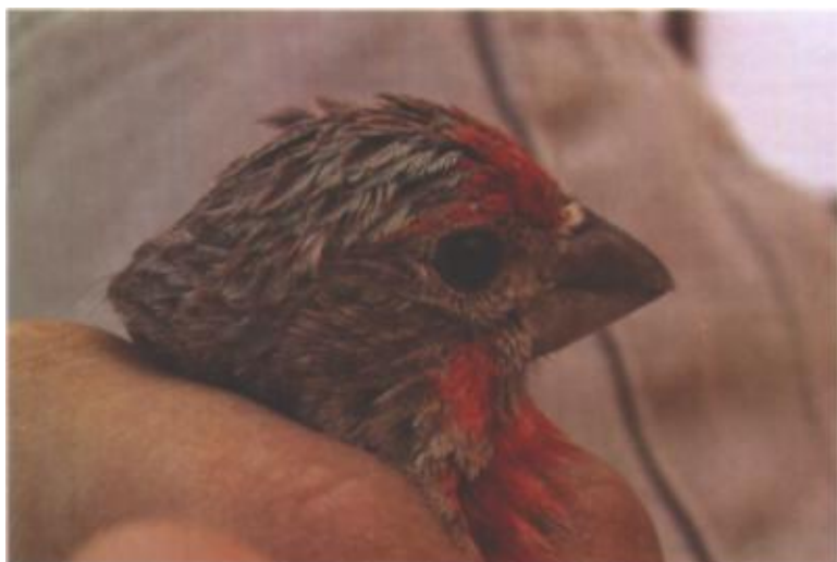
Figure 4. Guadalupe House Finch, Carpodacus mexicanus amplus , Campo Sur, Isla Guadalupe, 6 February 2003.