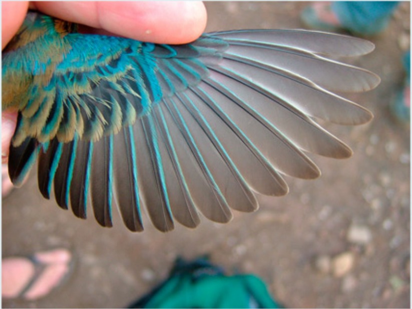
“Featured Photos” by © Peter Pyle of Point Reyes Station, California: Indigo Bunting ( Passerina cyanea ) more than one year old, captured 18 April 2011 in Cameron Parish, Louisiana, following eccentric prealternate molt (top); Indigo Bunting more than one year old, captured 8 March 2010 in Oaxaca, Mexico, in definitive basic plumage (bottom).